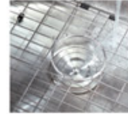
01 Bottom Grid