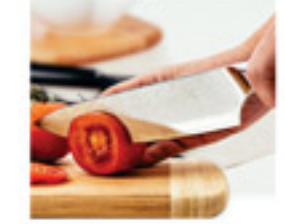
01 Damascus Chef Knife

This model is made from durable 16 gauge 304 premium stainless steel, highly resistant to heat, most household stains, and rust for the life of the product.