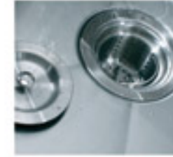
01 Strainer & Basket