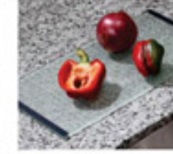
01 Cutting Board