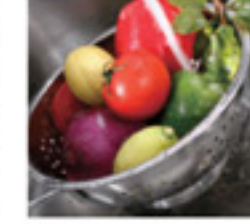
01 Salad Bowl