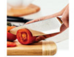
01 Damascus Chef Knife

This model is made from durable 16 gauge 304 premium stainless steel, highly resistant to heat, most household stains, and rust for the life of the product.