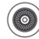
SIS-S01-04 Basket Strainer Brushed Nickel