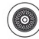
SIS-S06-04 Disposal Flange Brushed Nickel